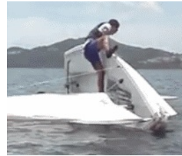
Video (1). Dry capsize 0:24. (As done Aug '15, unplanned, PW)

(Sections plagiarised from Caution Water.com , and Overy Staithe SC .) with thanks.