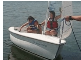
Video (3) includes Jibsheet 1:56.

Watch this full Capsize Recovery. Then we will break it down.